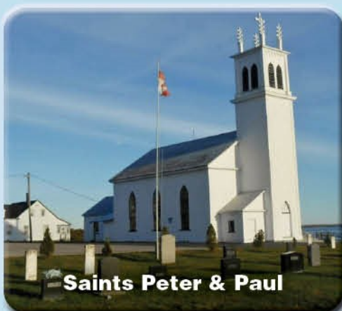
Saints Peter & Paul