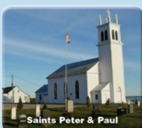
Saints Peter & Paul