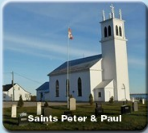
Saints Peter & Paul