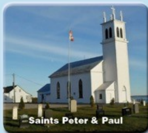
Saints Peter & Paul