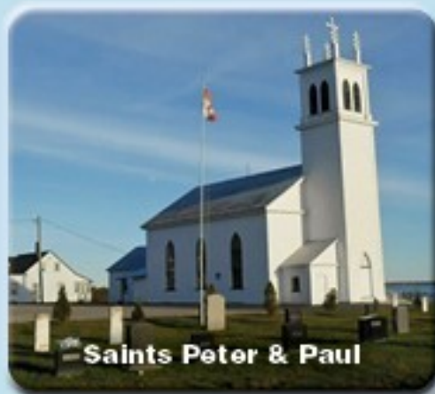
Saints Peter & Paul