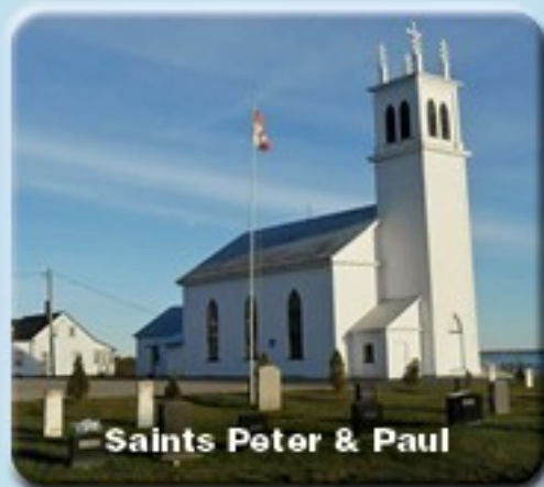
Saints Peter & Paul