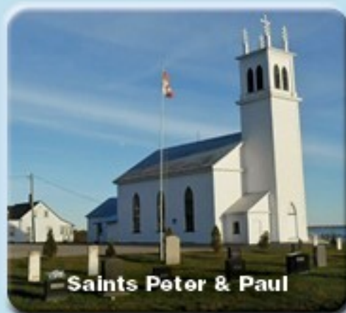
Saints Peter & Paul