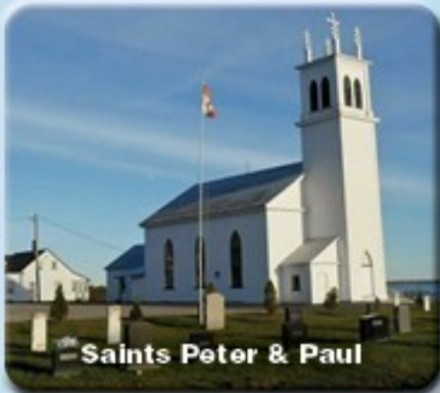
Saints Peter & Paul