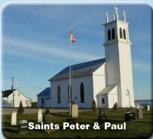
Saints Peter & Paul