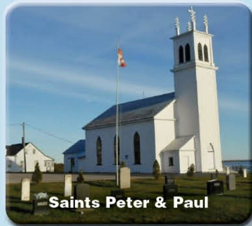
Saints Peter & Paul