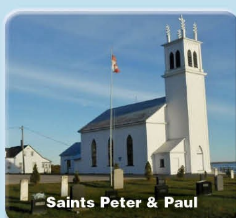
Saints Peter & Paul