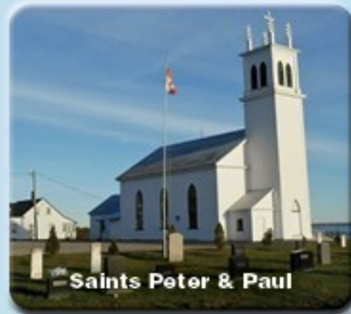
Saints Peter & Paul