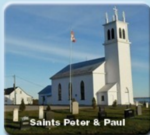
Saints Peter & Paul