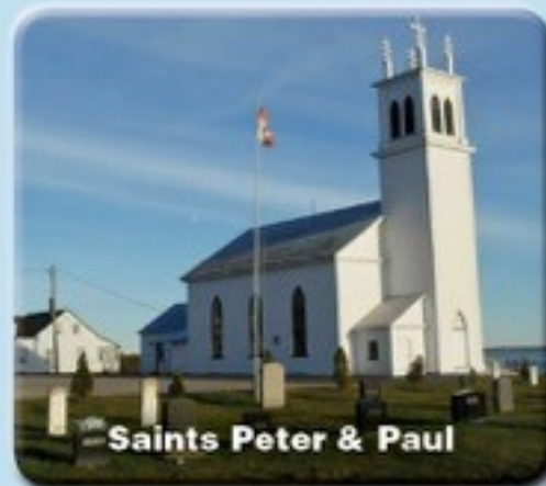
Saints Peter & Paul