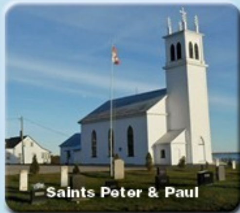
Saints Peter & Paul