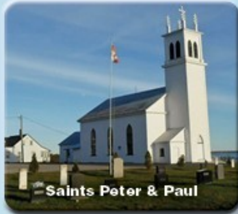
Saints Peter & Paul