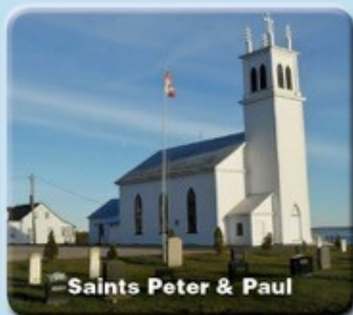
Saints Peter & Paul