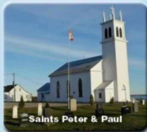
Saints Peter & Paul